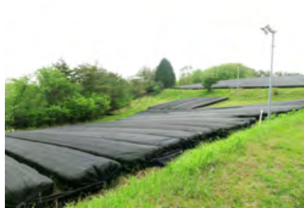
15 days before harvest 95% shaded