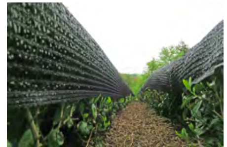
By mid-April, the top and the side of the tea fields are entirely covered by black fabric nettings.